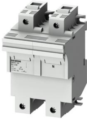
SENTRON, cylindrical fuse holder, 22x58 mm, 1P+N, In: 100 A, Un AC: 690 V